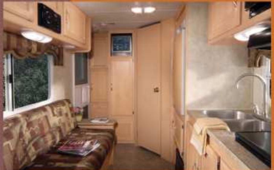
718FD Pictured above and below

Zoom features designer décors with luxurious fabrics, hardwood cabinet doors and residential vinyl flooring. Plus, storage is not compromised in Zoom . All models feature wardrobes, overhead cabinets and a spacious exterior compartment.